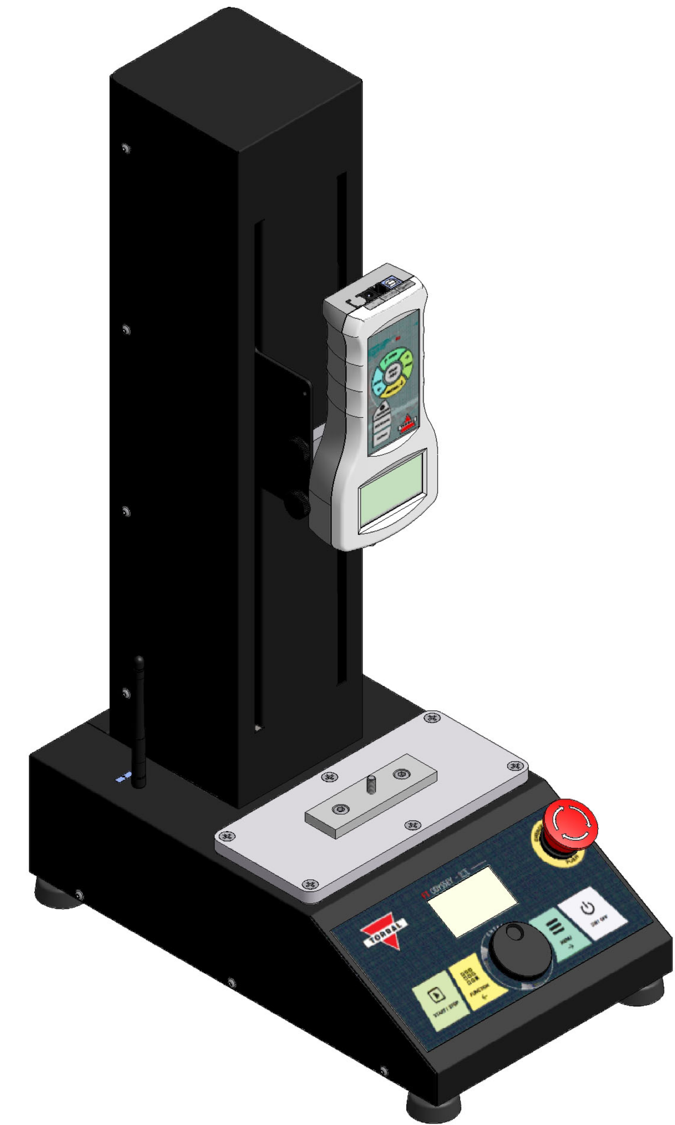
FTV100 VERTICAL (METRIC)